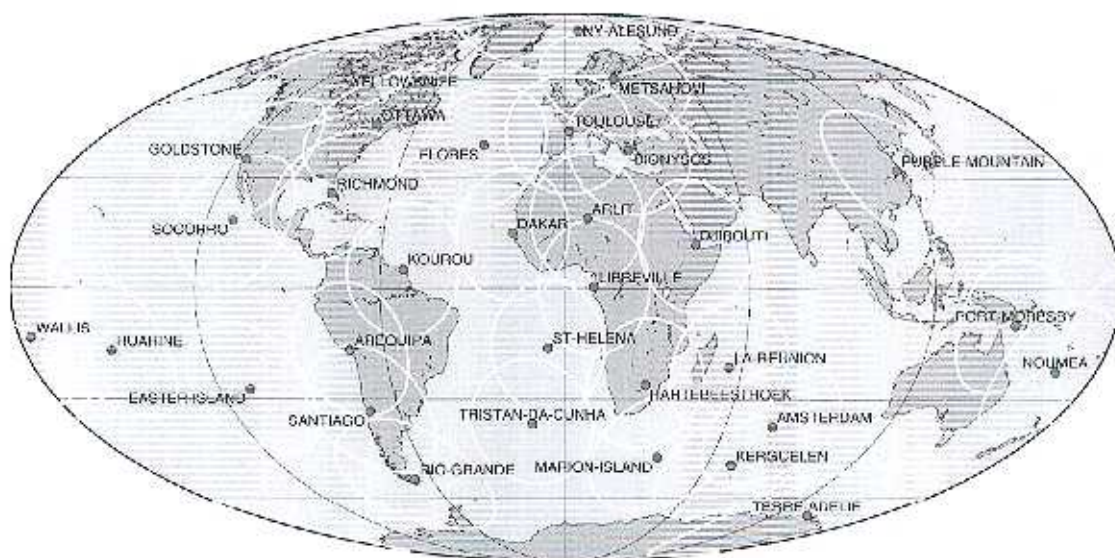
Figure 2: Map of the DORIS network upon SPOT-2 launch (January 1990)

too many figures, — good information, but too much detail